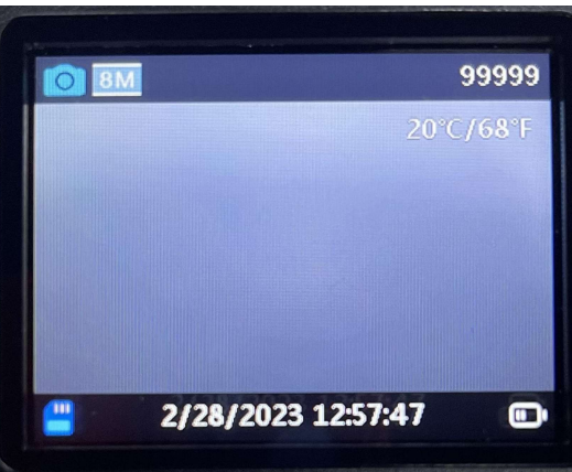
Figure 3 Preview information display

Slide the Mode Switch to " SETUP ", then the Camera will enter Set up mode. When the camera is enter " SETUP " mode the current settings will be displayed on screen.